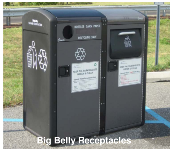
Big Belly Receptacles

In June 2010, the DOA installed seven BBRs – 5 in PHL’s Cell Phone Waiting Lot and 2 in PHL’s main Employee Parking Lot bus shelters. These BBRs contribute, on average, almost two tons of recyclables a year. The analysis used data from June 17, 2010 through June 1, 2011.