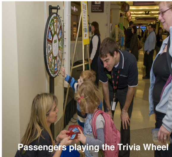
Passengers playing the Trivia Wheel

Travelers, merchants and airport employees participated in DOA sponsored activities including: A “Spin to Win” trivia game (suited for all ages) that tested participants’ general knowledge of environmentally-related questions from plastic, glass, aluminum and mystery categories.; a “Guess Your Best” game challenged participants were asked to guess the number of plastic bottles soda/water bottles contained in a 5 ft. tall clear bag based on a given recycling-based clue directly related to the answer; a PowerPoint presentation on recycling-related initiatives at PHL; and a “Recycling Sleuth” who searched for people recycling in the designated receptacles. The event was a huge success with over 200 people participating in activities and more than half receiving prizes.