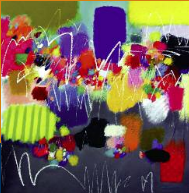
Moe Brooker: Painting